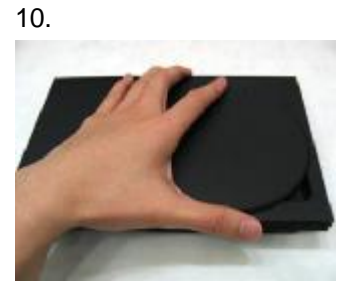
Attach the Flip Top Cover to the console carefully.