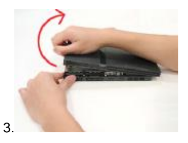
Starting remove from the top left corner, bottom left corner, and then whole piece.